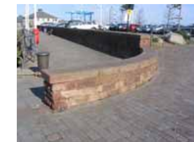
Example of wall