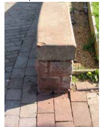
Example of wall

Proposed wall. To be constructed of sandstone blocks 150x300mm (approx), 1:3 mortar joints on concrete footing, on consolidated MOT Type 1.